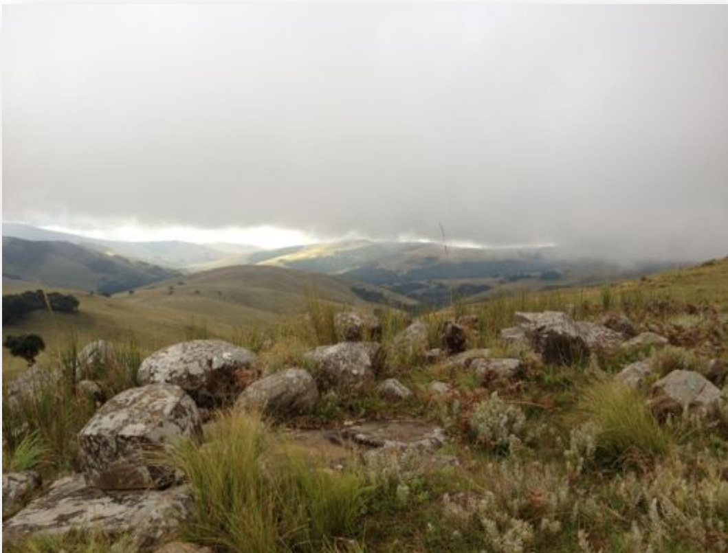
Figure 1. Ingeli forest mosaic in southern KwaZulu-Natal.